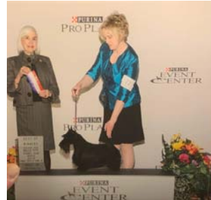
Talisman I am the Storm of Christimoor, aka "Greyson"