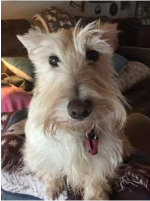
Talisman Lady Kate of Baileys Harbor, aka "Katie"