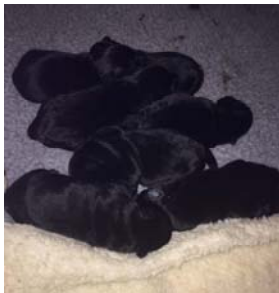
12 y/o Izzy Endvick Loved and helped with the new pups.