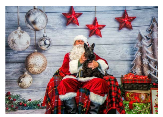
(Above) Santa with just one of the good Scotties that came to wish him well. (And, try to pull off his beard! LOL!)